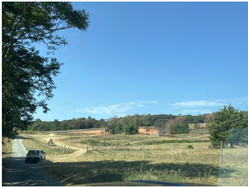
4. View of fields and burned area from pipeline rupture