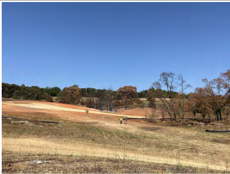
8. View of burned (red) and filled (lighter-colored) areas