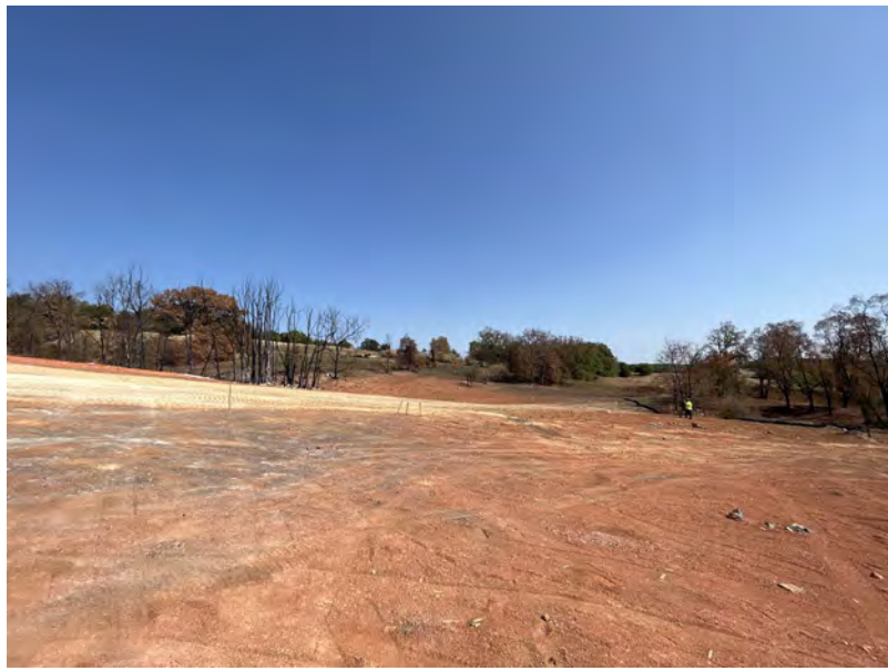
11. View of burned area (red) and filled area (lighter-colored)