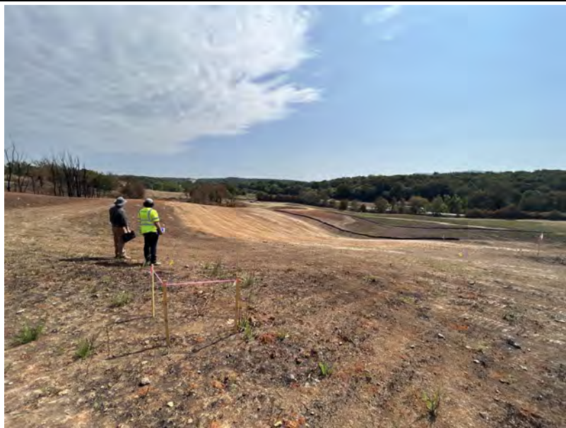
16. View of corner of the working area (marked by pink flagging)