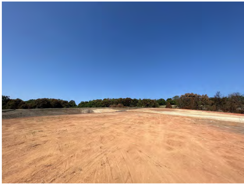
10. View of burned area (red) and filled area (lighter-colored)