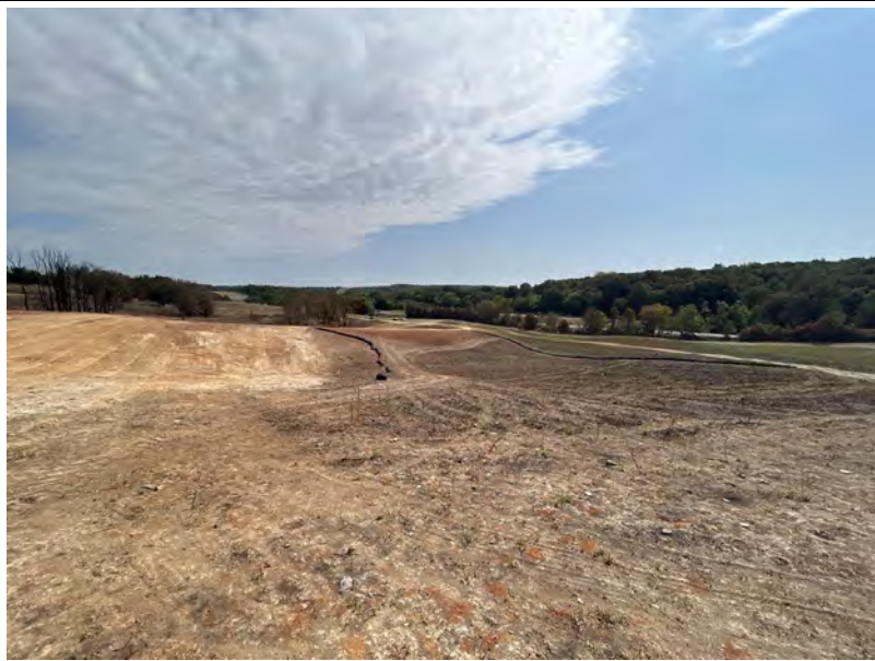
17. View of filled area and silt fencing