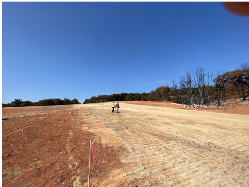
12. View of burned area (red) and filled area (lighter-colored)