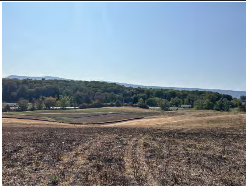
15. View of charred hillside