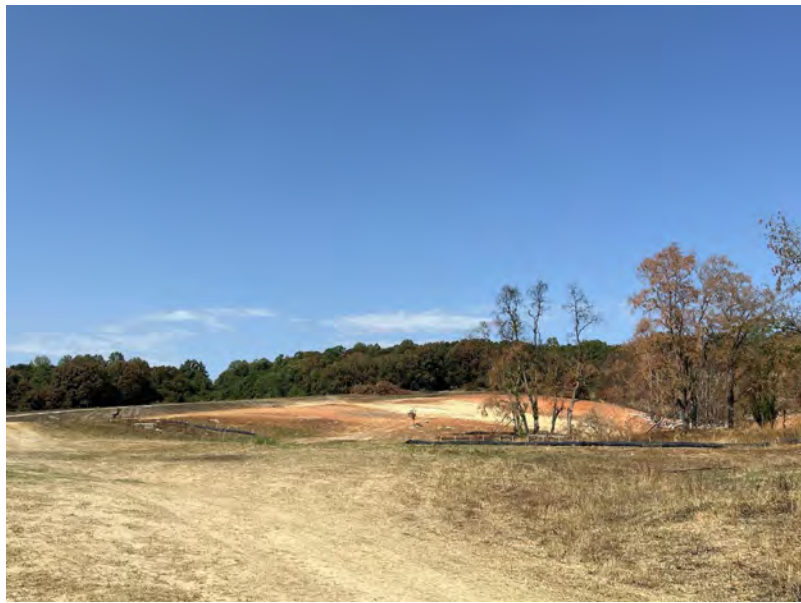
5. View of burned and filled area from entrance road