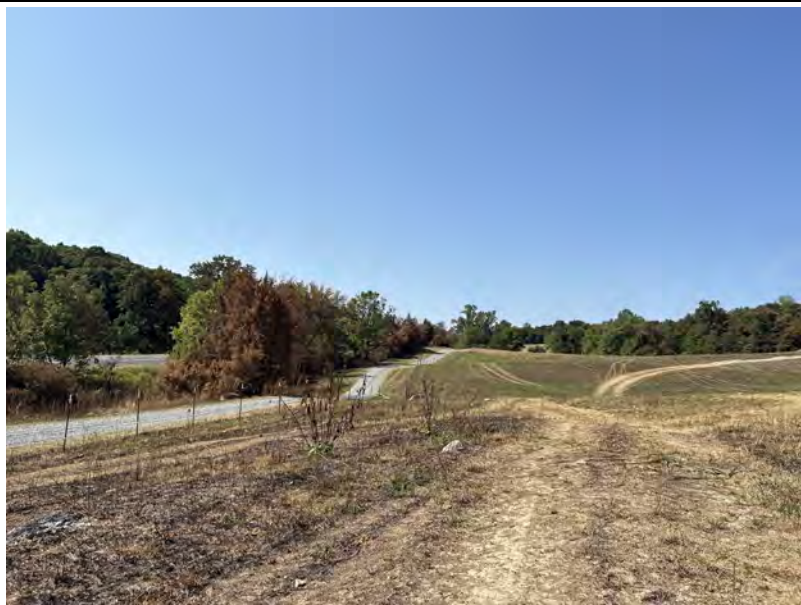
7. View of access roads and trails serving the working area