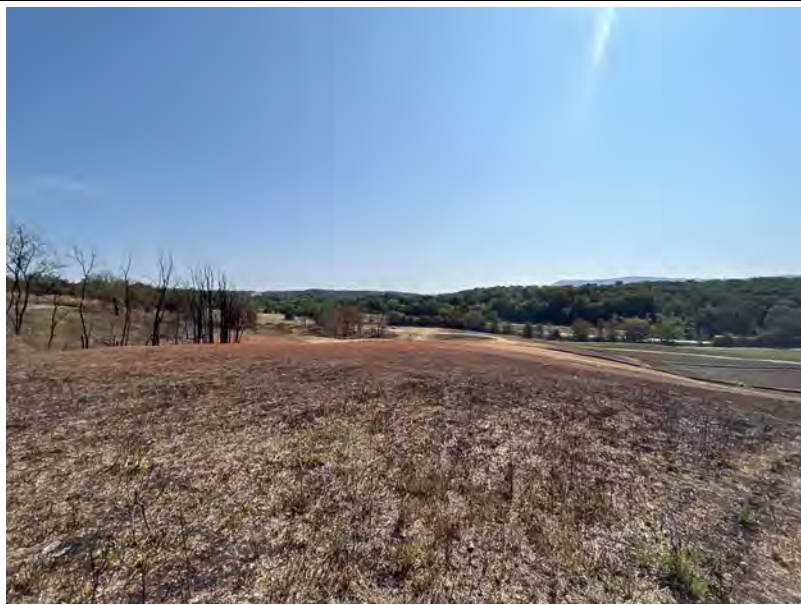
14. View of charred hillside