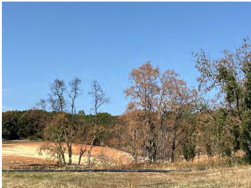
6. View of scorched trees and burned hillside