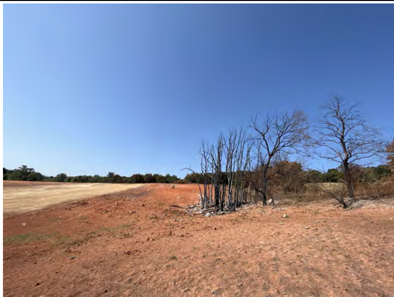
13. View of burned area (red), filled area (lighter-colored) and burned trees