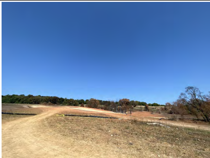
9. View of burned pipeline corridor