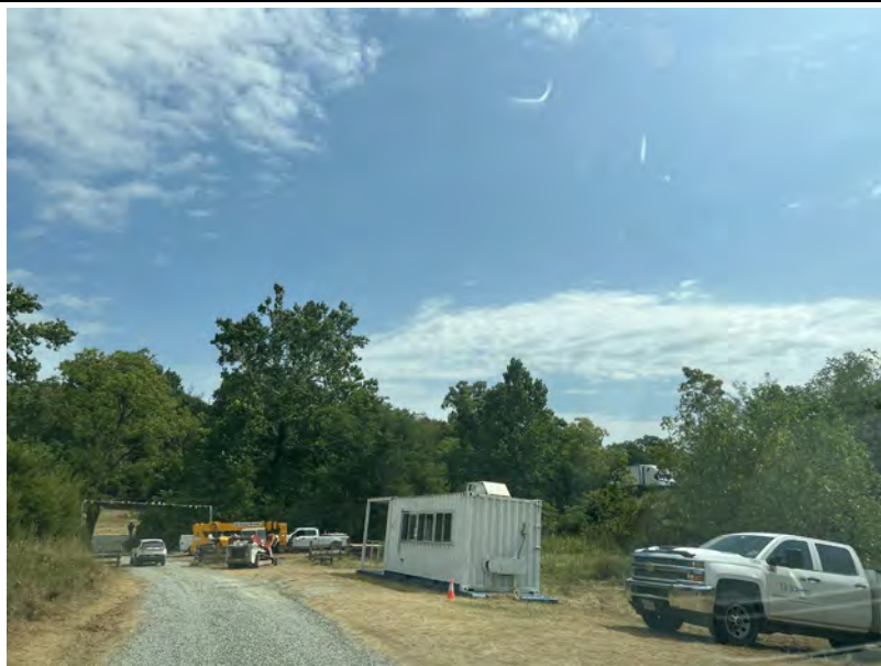
18. View of staging area