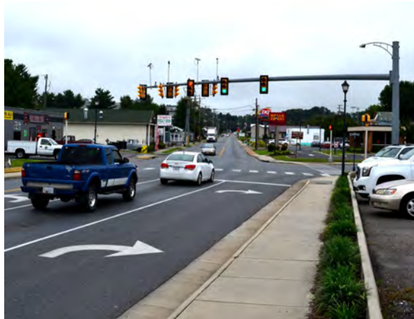
Traffic signal projects like the one at Main Street and Mount Crawford Avenue and the intersection of Dinkel, Old River, and Main Street play an important role in alleviating traffic problems on Main Street.

Amtrak service is available in Staunton, approximately twenty-five minutes south of town. Railway freight services are available in Harrisonburg. Commercial passenger air services are available at the Shenandoah Valley Regional Airport in Weyers Cave, approximately fifteen minutes southeast of Bridgewater.