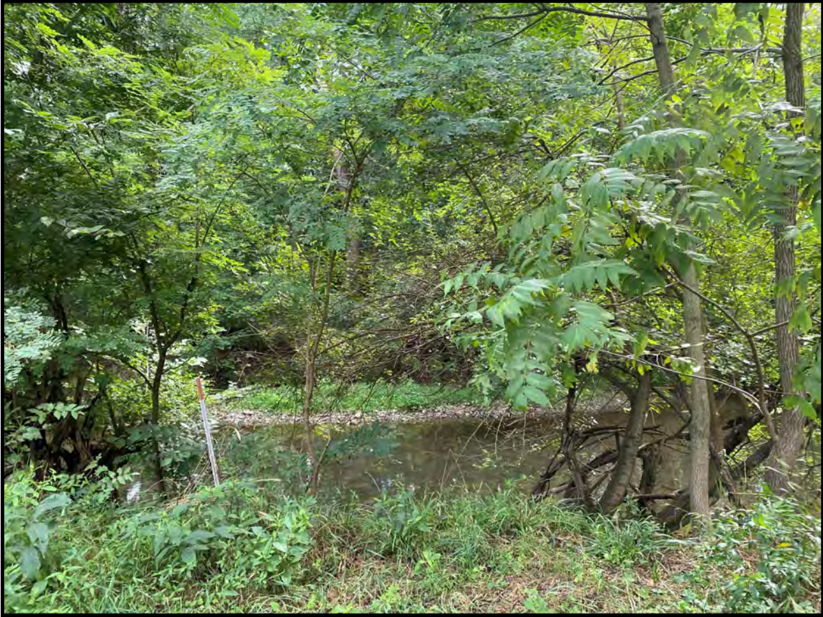
Another photo above of the 3.112 acre parcel that would be purchased with the Virginia Outdoors Grant. Parcel also includes land on a small island that would be preserved as natural space, possibly connected by a pedestrian bridge in a future grant.