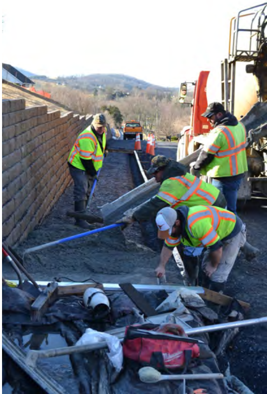
New sidewalks can be installed using grant money or development requirements, or by “in-house” projects completed by our crew, like this one on Mountain View Drive.