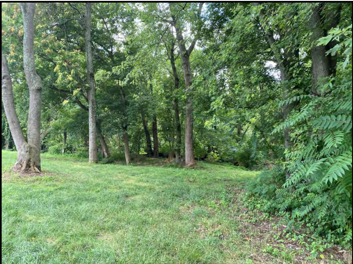
Images above of the 3.112 acre parcel that would be purchased with the Virginia Outdoors Grant. Forested land will be preserved, with the addition of a walking path to connect to Riverwalk.