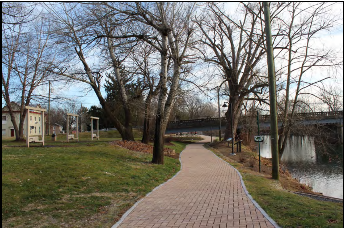
A photo of Phase I of Riverwalk. A similar path made of permeable pavers would be constructed on the 3.112 acre parcel if acquired by the Virginia Outdoors Grant. (Path would be constructed through funding by a VDOT Transportation Alternatives Grant which we're applying for in October 2021.)